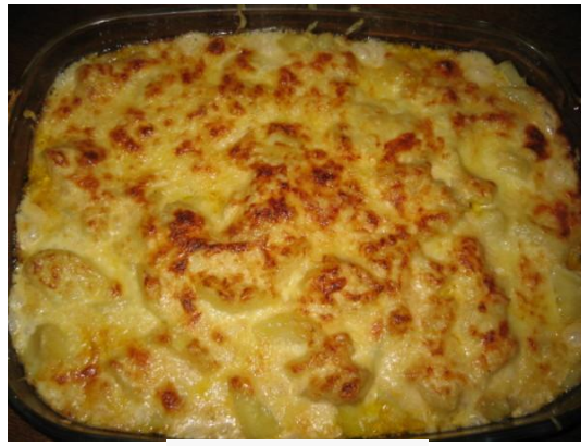
The « gratin »